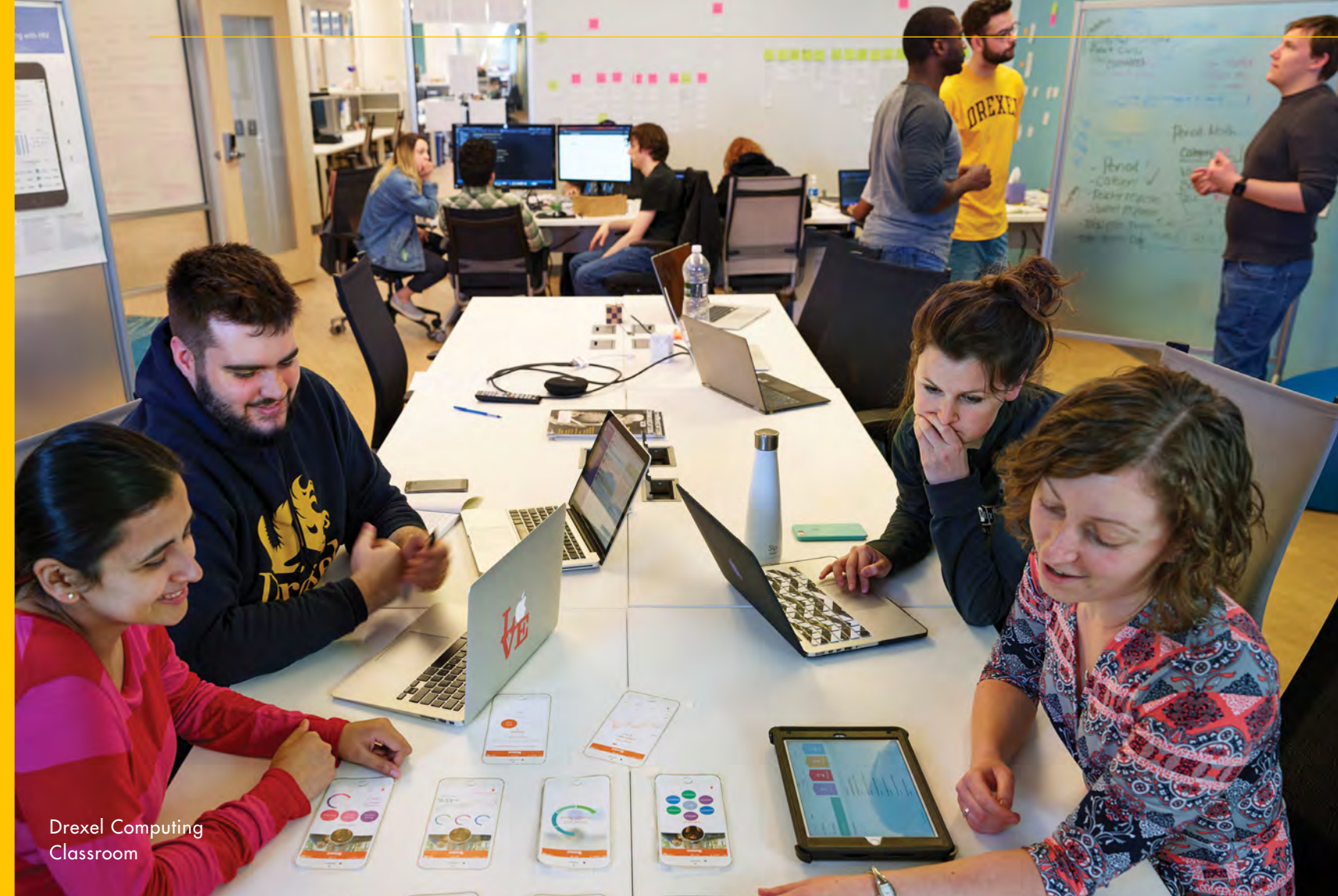
Drexel Computing Classroom