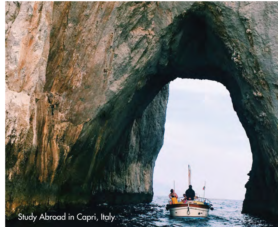
Study Abroad in Capri, Italy

Civic Engagement: We believe in the importance of giving back to local communities — there are always opportunities to make an impact and serve the community here. Students can get involved on campus through Drexel's Lindy Center for Civic Engagement and the Dornsife Center for Neighborhood Partnerships during community-based learning courses and volunteering for community service. But our impact doesn't stop there; our dedication reaches out globally to improve the world around us.