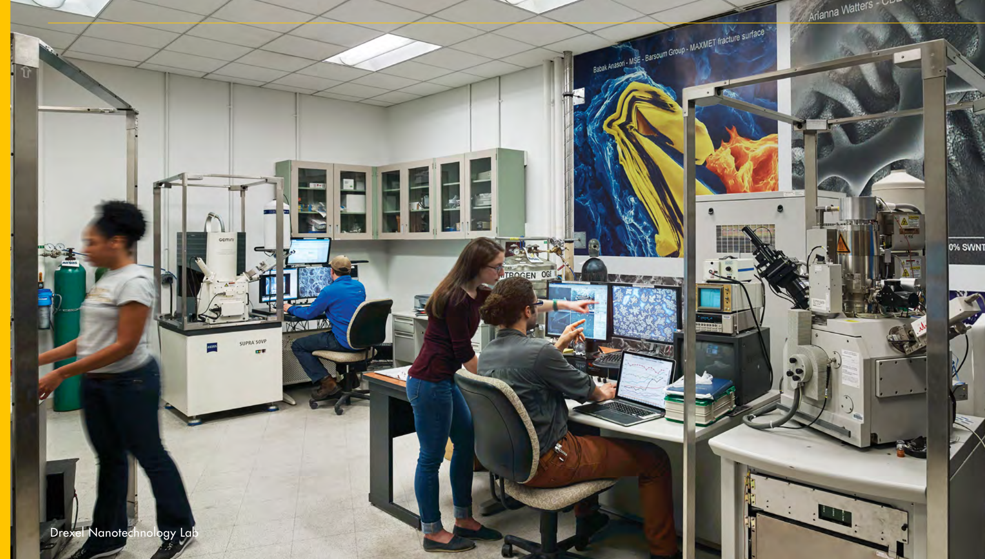
Drexel Nanotechnology Lab