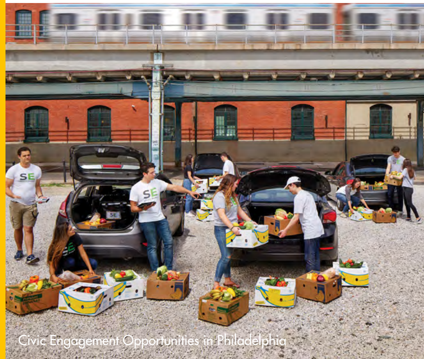
Civic Engagement Opportunities in Philadelphia