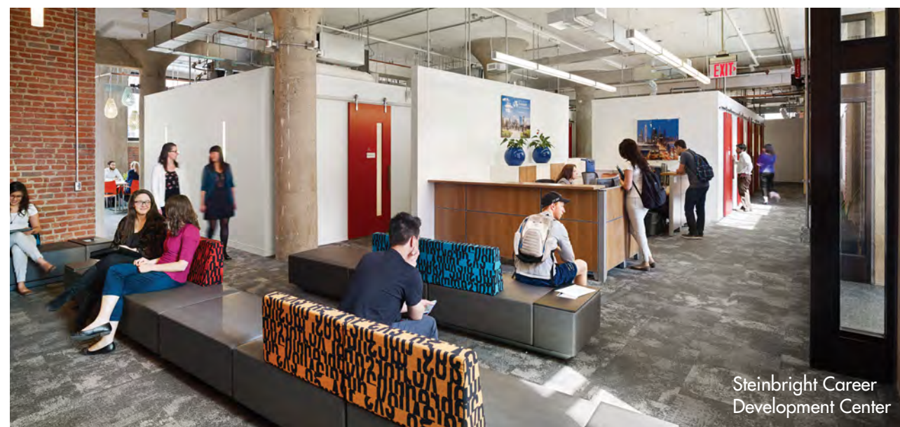
Steinbright Career Development Center