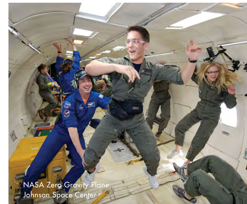
NASA Zero Gravity Plane, Johnson Space Center