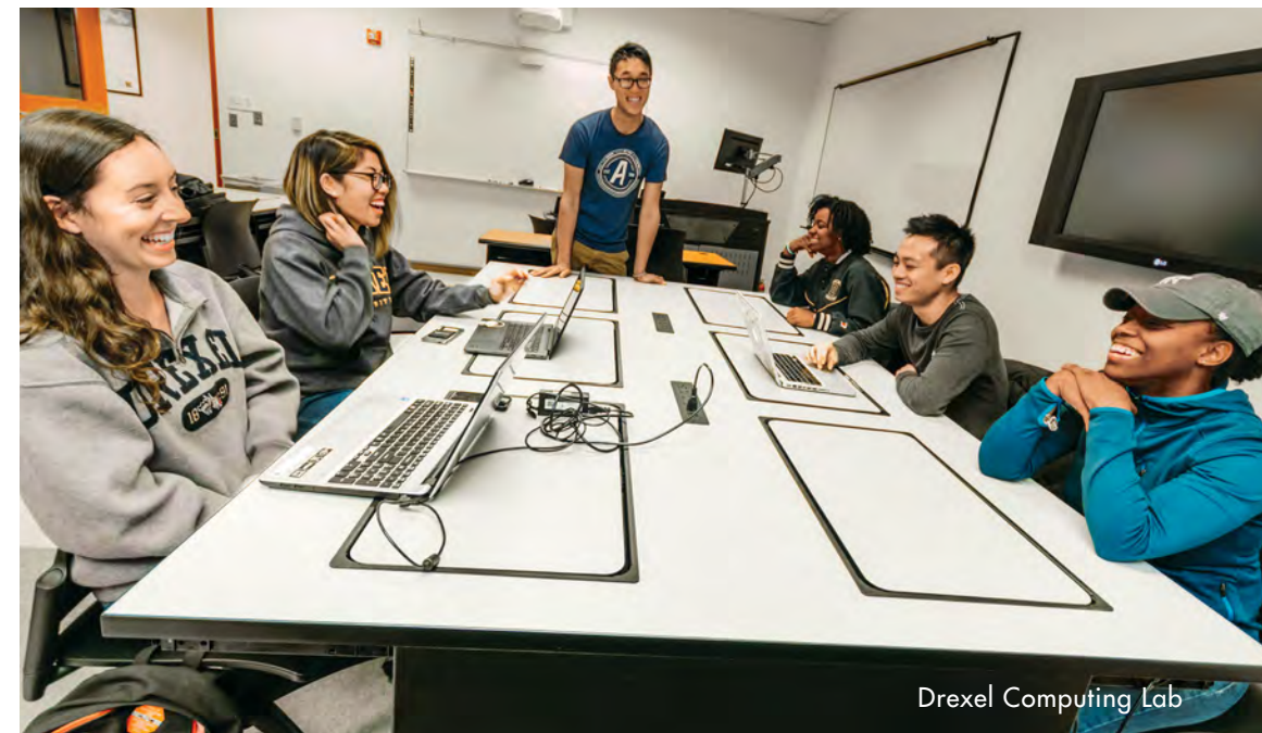
Drexel Computing Lab

Through Drexel's information systems programs, you can use your technological, business, and communication skills to enhance the human experience and make an impact on the world around you. Learn more about our information systems programs at drexel.edu/academics .