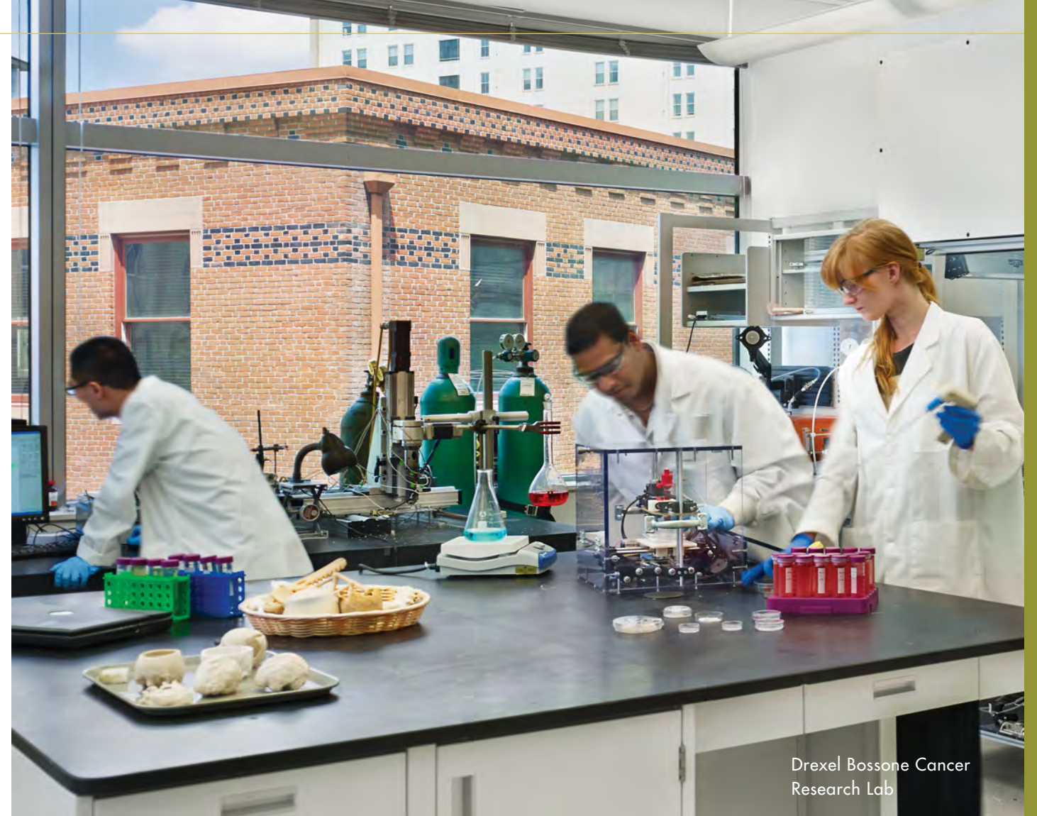
Drexel Bossone Cancer Research Lab

Much of human progress can be attributed to the ingenuity of engineers. It is the curiosity of those who choose this path that drives creation and leads the inventions that improve the functionality of civilization. Virtual reality, the skyscraper, and the electric car are all results of an inquisitive mind built upon a scientific approach. Through these innovations, engineers change the way that we interact with one another and allow us to enjoy a heightened quality of life. Whether you wish to usher in the next wave of renewable energy technology, print 3D biological tissue for cancer research, or build the cities of tomorrow, Drexel will hone your skills and bring you to the forefront of engineering.