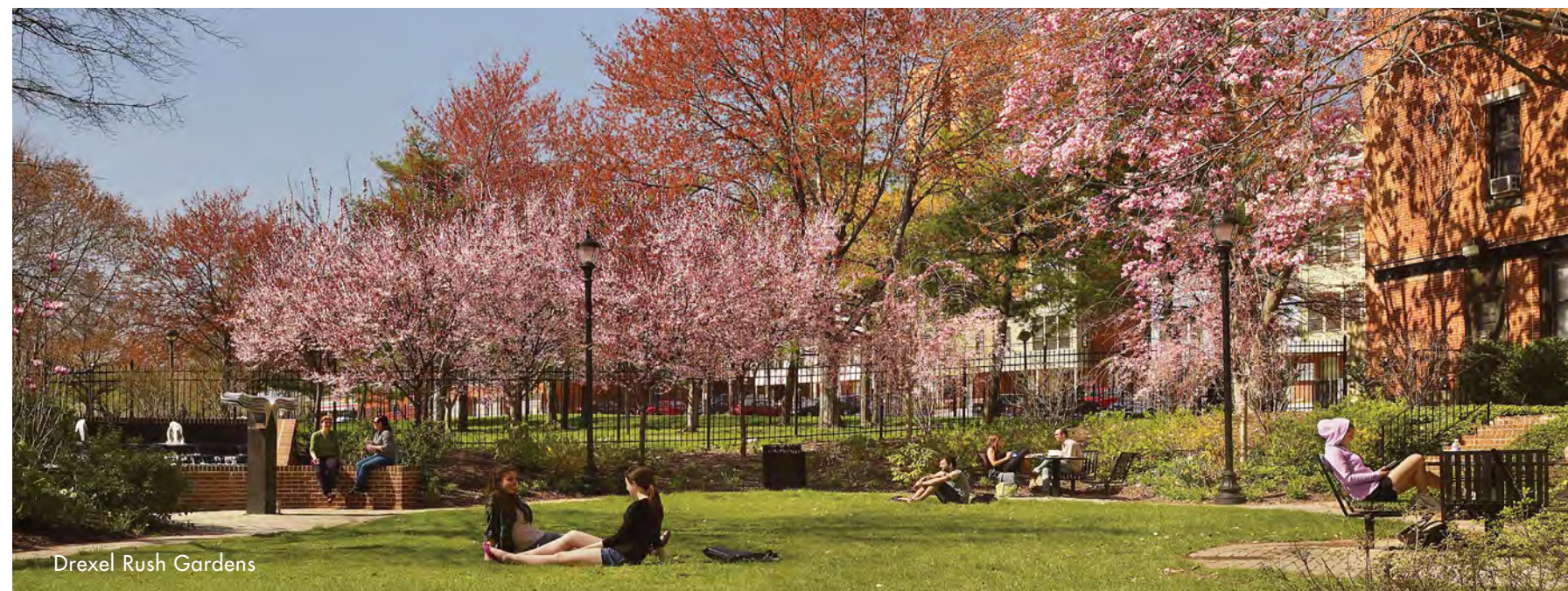
Drexel Rush Gardens

Our Admissions Blog gives you the insider's view of Drexel University. From tips about the admission process to a preview of life on campus and in Philly, you'll learn from those who know it best. Learn more at drexel.edu/undergrad/blog .