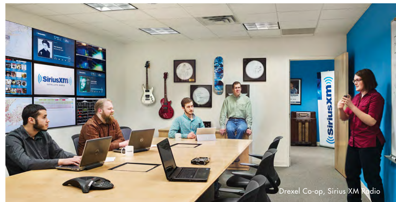
Drexel Co-op, Sirius XM Radio

This unique combination of traditional learning and hands-on experience gives you the opportunity to collaborate with leading professionals in your field and make a true difference in today's data-driven world. Learn more about our computing and data analysis programs at drexel.edu/academics .